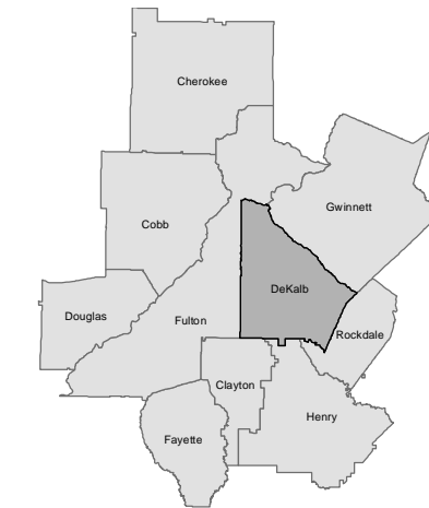
FIGURE 1 PROJECT STUDY AREA